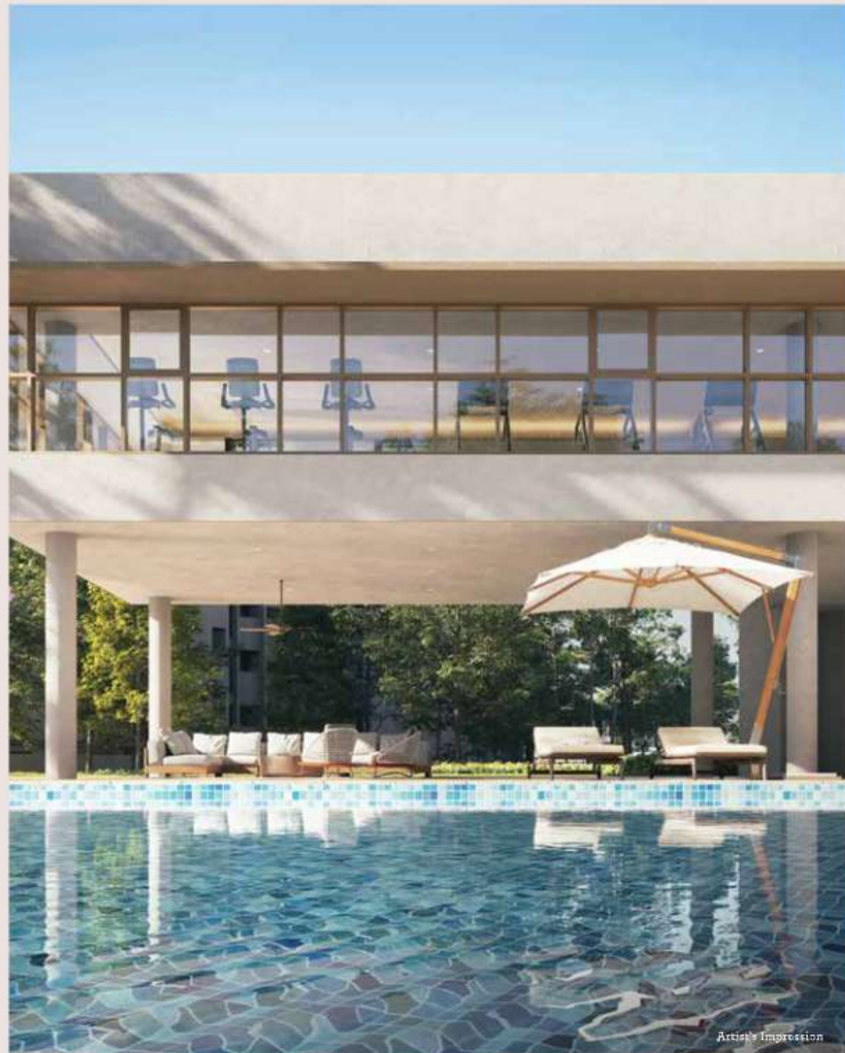
Refresh your days with a cooling swim in the Infinity Lap Pool

A crystal clear Infinity Lap Pool expands your horizons for relaxation and rejuvenation, while a well-equipped cantilevered gym brings more movement into your day.