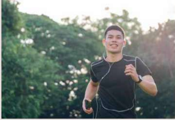
/ Jogging track within the embrace of nature