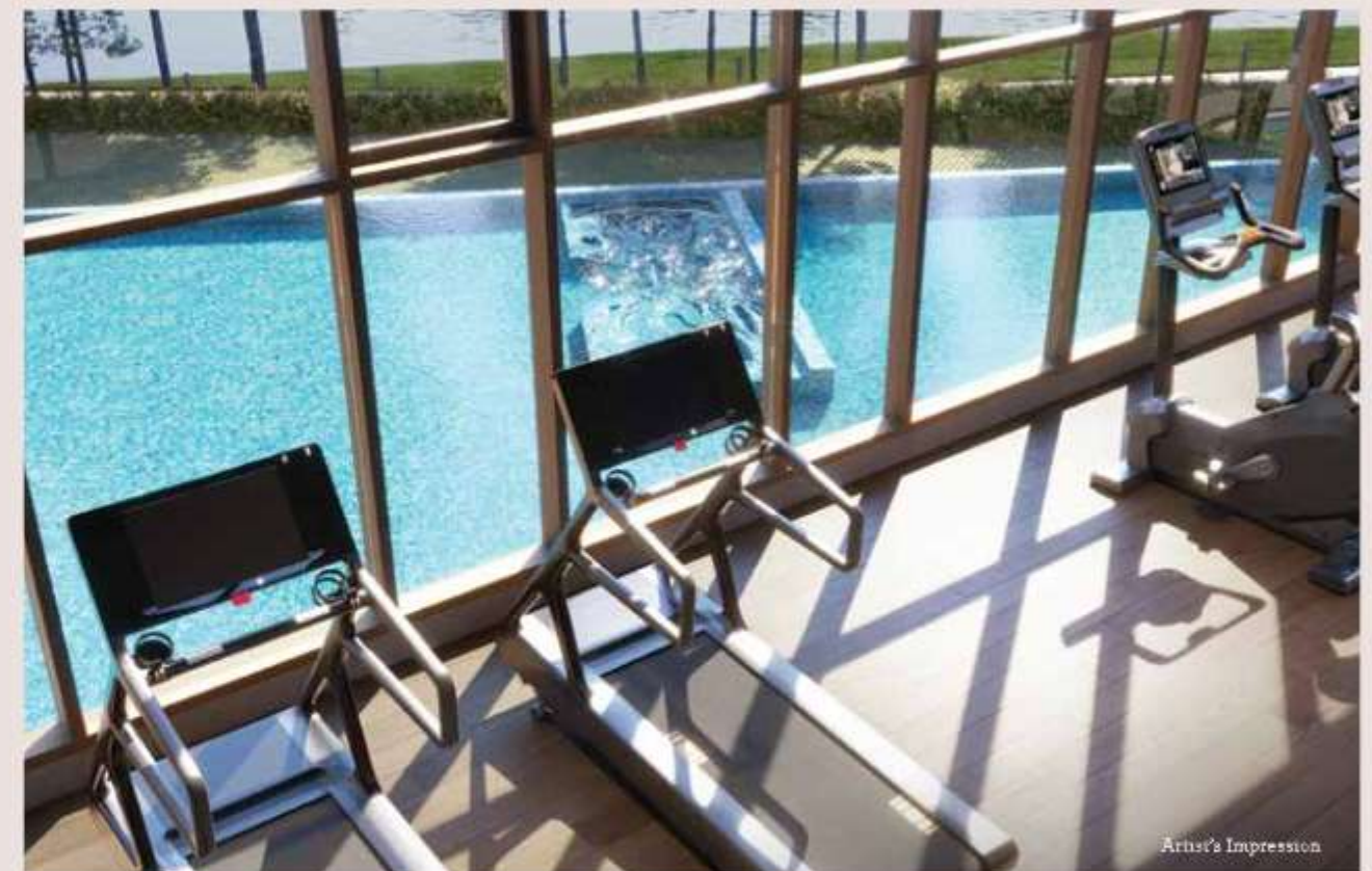
Enjoy daily workouts with a view at the Gym

For moments where one can simply enjoy being present, or relish in casual quality time with guests, the Sun Decks and Lounge make for the perfect elegant setting.