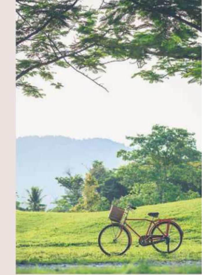
/ 4 acres of private park